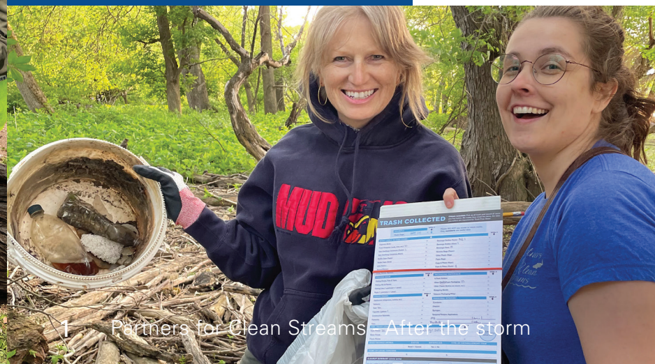
1 Partners for Clean Streams - After the storm